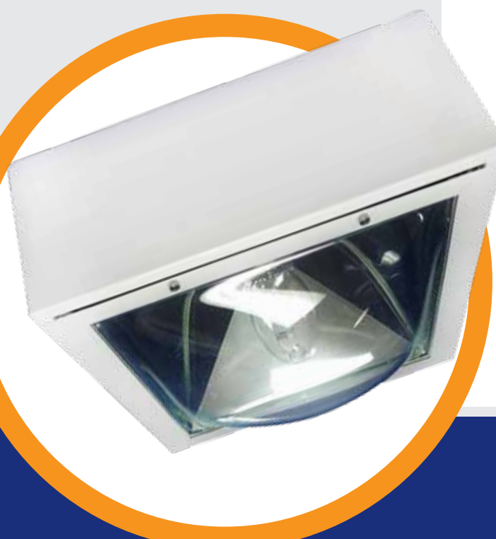
Dome Glass Clear or Obscure